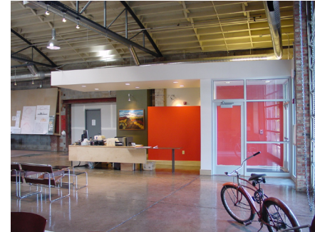
Sawmill Building Redevelopment